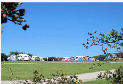
Blue Hills Touring Park