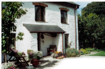
Trevaunance Cottage B&B